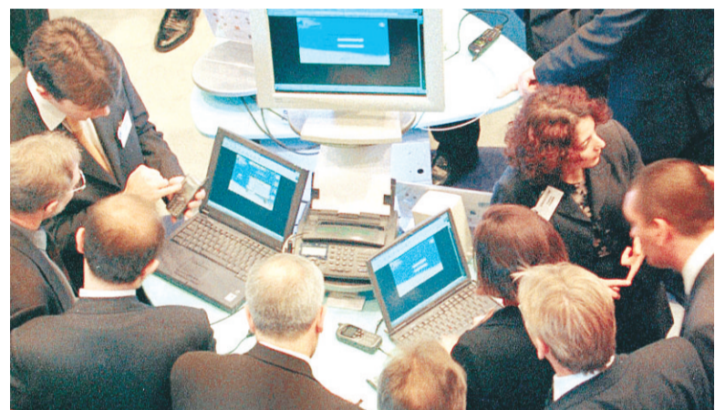
TECH NEEDS: Internet brand Superonline prepares a special solution package to meet the telecommunication needs of small and medium-size enterprises.