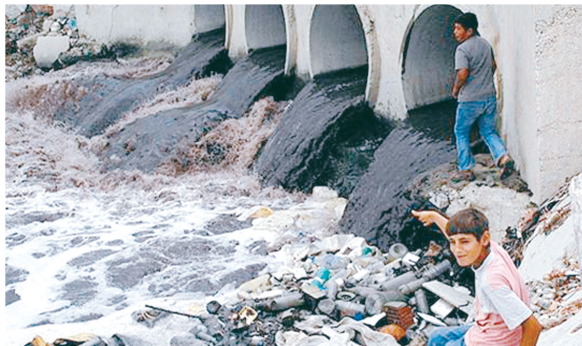
CONTAMINATION: Environmentalists blame the contamination of the Çorlu Stream on the Çorlu Leather Organized Industrial Zone, but the zone's manager says it has the biggest and the best drainage-water treatment facility in the world.