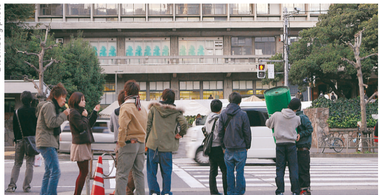
CREDIT CRUNCH: Students wait to cross an intersection in front of the main entrance to Keio University in Tokyo, Japan, in this file photo.