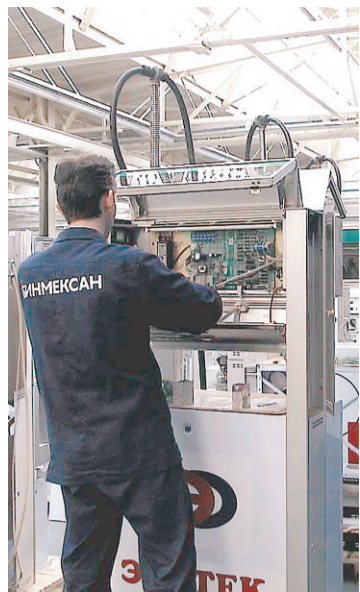
CALL: There has been a call to find partners for projects recently.